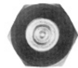
Prism Sight Glass RR Part No. 7690

The prism sight glass eliminates the need for the polyethylene floating ball. For use with fittings 1/2 - 14 NPTF thread and Refrigerant Sealer.