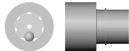
Welded Sight Glass RR Part No. 1521

Contact engineering department for application details.